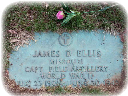
Tpr. James. Ellis' grave is located in Floral Hills Cemetery, Raytown, MO.

On January 7, 1942, one month after the attack on Pearl Harbor and the bombing of the airfields in the Philippines, Japan began the invasion of the Philippines. This act of aggression—the attack on Pearl Harbor—gave the Japanese air superiority over the entire Philippine Islands in one day.