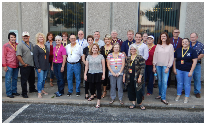
Pictured are the participants of the 2016 Community Alliance Program in Troop D.