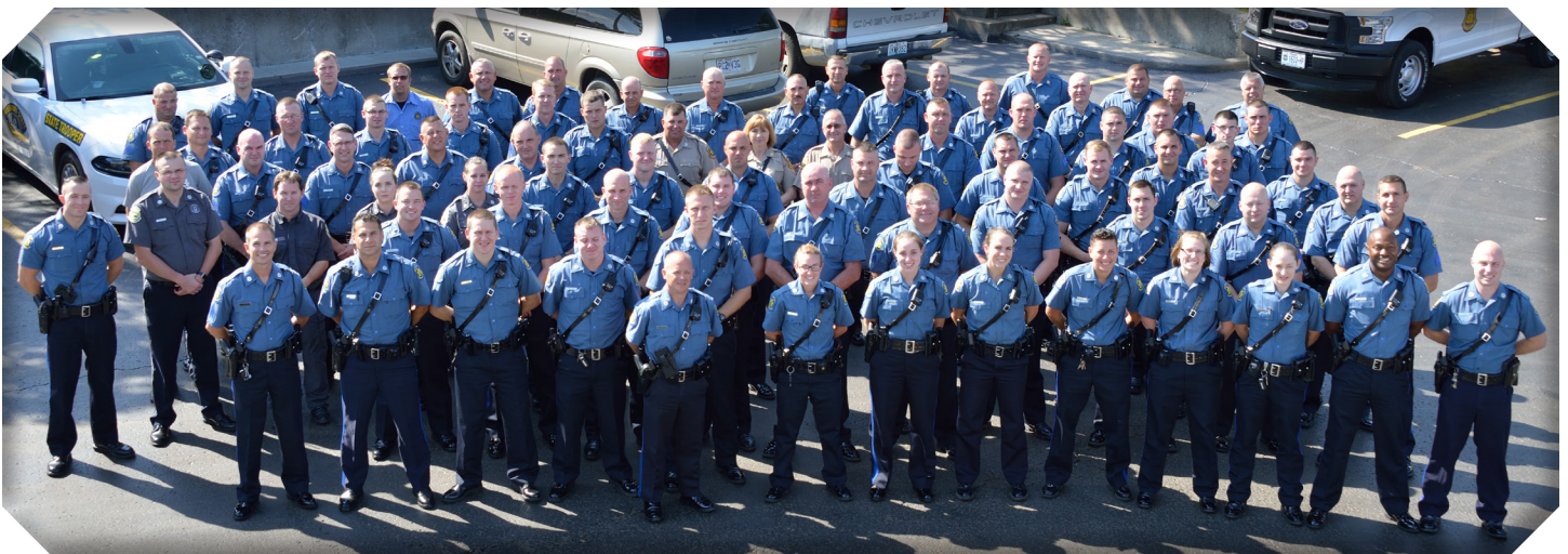
The 2016 Missouri State Fair detail is pictured.