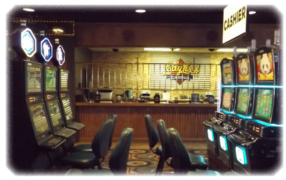
Lady Luck Casino in Caruthersville Mo, is pictured.