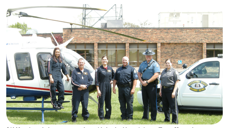
LifeNet air ambulance personnel provided valuable training to Troop H members.

In April and May, LifeNet Helicopter personnel provided landing zone training to Troop H personnel. Throughout the state, air ambulances are dispatched frequently to transport critically injured traffic crash victims. A classroom presentation outlined the dos and don'ts when preparing a landing zone and also the criteria for requesting a response from an air ambulance. LifeNet pilots landed one of their air ambulances in front of Troop H for each training session. Pilots and flight paramedics gave a tour through the helicopter and provided instruction on how to maneuver properly when approaching a helicopter and how to shut down the helicopter in an emergency. Flight paramedics explained the helicopter's capabilities and demonstrated how patients are loaded. LifeNet