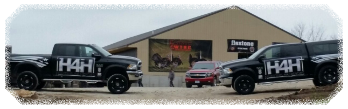
Hunting for Heroes trucks wait at the entrance to welcome heroes, guests, and participants.