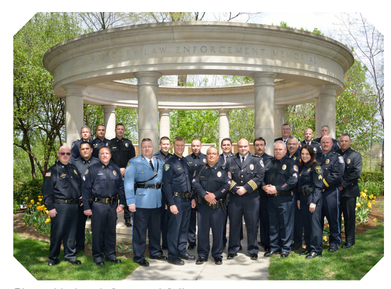
Pictured is the 5th Command College.

and the Patrol. It takes the employee out of their comfort zone, they work with other agencies, and they have the opportunity to further their education and develop relationships to learn from others. The agencies represented were diverse in size, and the agency