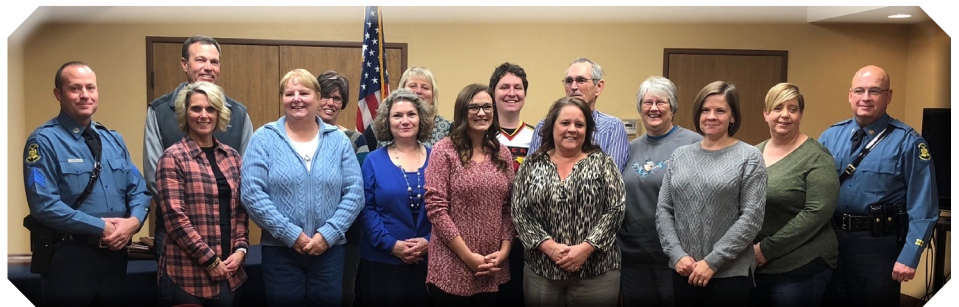
Congratulations to the participants in Troop B's 2018 Community Alliance Program for successfully completing the experience!

The program also provides an opportunity for the members of Troop B