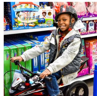
This young man was jubilant after choosing a new bicycle.