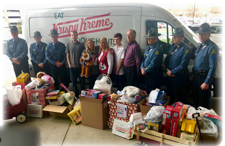
The 2018 Cpl. John A. "Jay" Sampietro Jr. Toy Drive was a resounding success! Thank you to everyone who participated or donated.