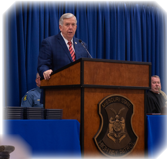
In his keynote address, Gov. Michael Parson told the new troopers to always remember they are public servants.

Troop F's Color Guard provided the flag ceremony with decorum and