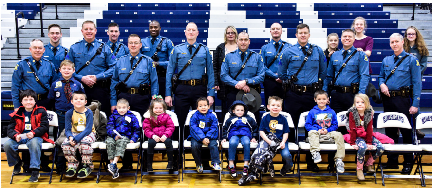
The Patrols Operation T.O.Y.S 2018 was a success!