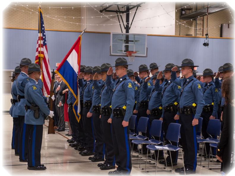
The 106th Recruit Class salutes during the national anthem.

gentle West Virginia accent, thanked God for this day and the men who had accepted the call to become a trooper, then asked for Him to keep them safe.